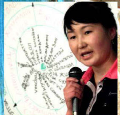
Conferees are required to discuss in small groups and present Biblical solutions to local issues/problems

We might have taught them the New Testament, but they showed us how to live it.