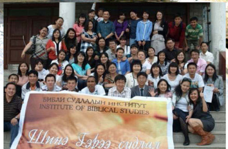
Conferees consisting of Mongolia CCC staff and disciples