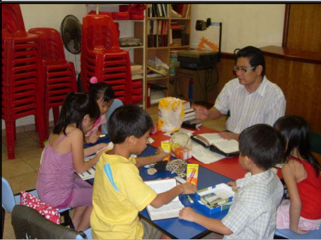
▲ ▼ Mentoring is no child play—mould them while they are malleable.