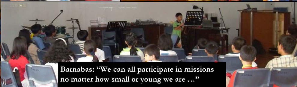
Barnabas: "We can all participate in missions no matter how small or young we are ..."