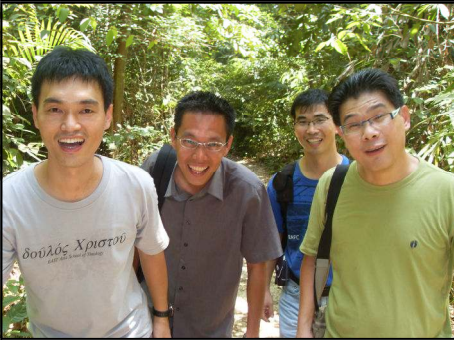
▲ Hiking with EAST Family Group members at MacRitchie Reservoir.