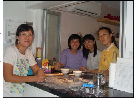
▲ Ministry around the kitchen table.